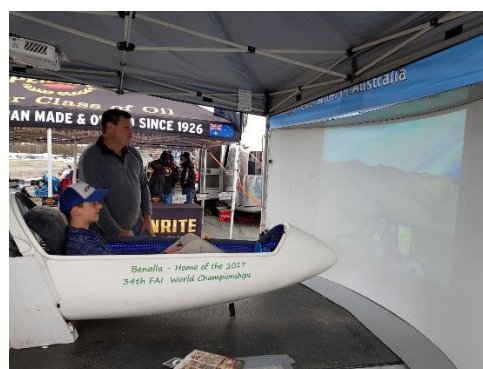
Analogue Mobile Simulator