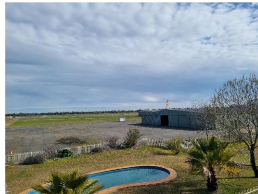
View to SW