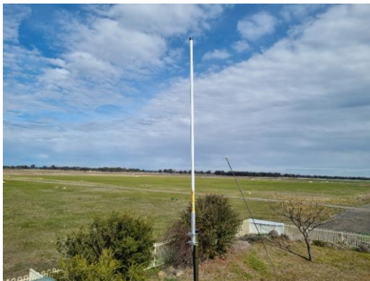
View to SE